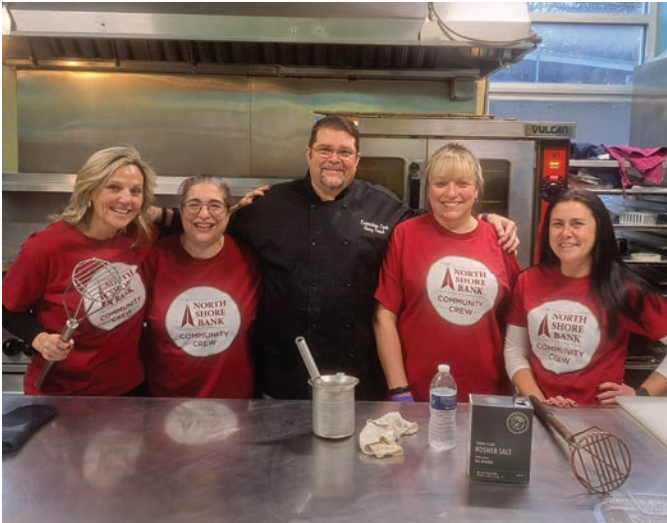
North Shore Bankers worked the kitchen and prepared meals for the clients of LifeBridge North Shore in Salem