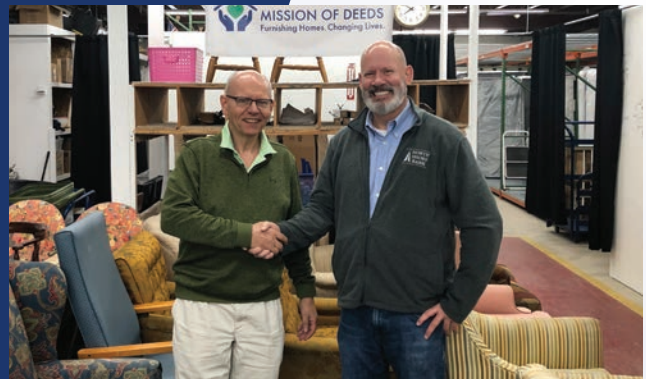
North Shore Bankers supported Reading's Mission of Deeds through volunteering and charitable efforts