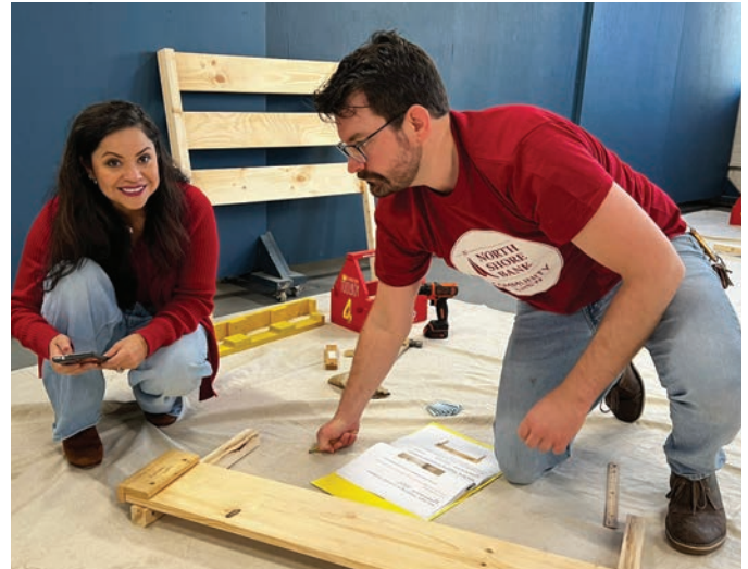
Crews assembled children's beds at Lynn's A Bed For Every Child — a program of the MA Coalition for the Homeless