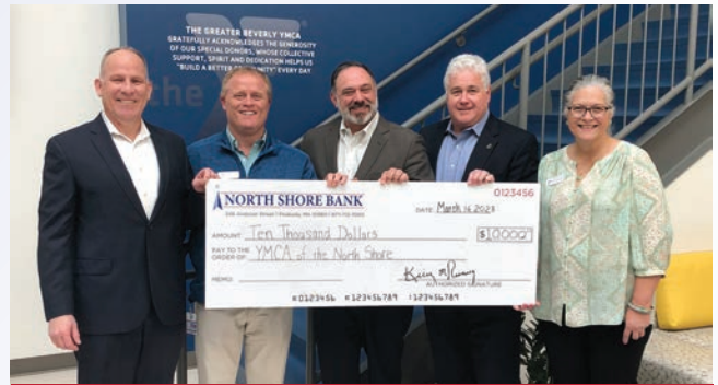
North Shore Bank provided financial support for area nonprofits like the Greater Beverly YMCA

North Shore Bank continued its support for a wide range of nonprofit organizations throughout our service area. Whether through direct financial support or ongoing volunteer efforts, giving back to the community is part of our company makeup. Below is a listing of many of the organizations to which we provided financial assistance in 2023: