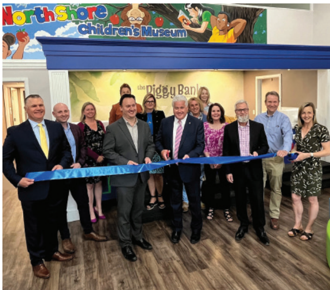
North Shore Bank pledged a multi-year financial commitment to the North Shore Children's Museum

In 2023, North Shore Bank provided financial support to more than 200 different nonprofits across the region. These donations benefited a wide of range of groups, serving the