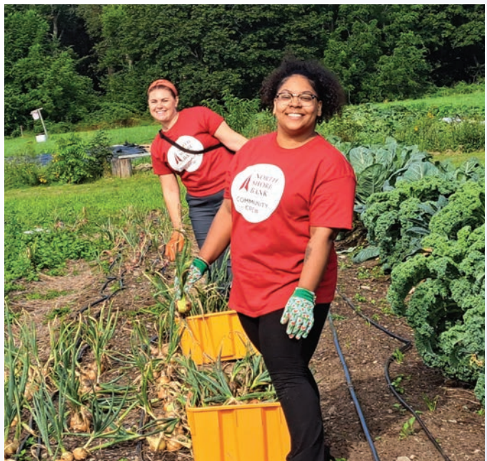
NSB volunteers helped out at Peabody's Newhall Fields Community Farm – a nonprofit serving area food pantries