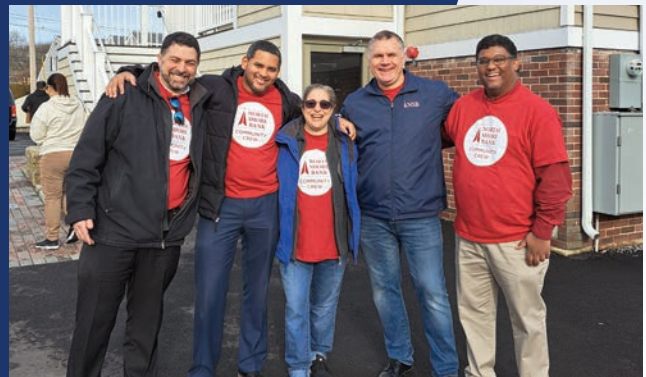
North Shore Bank Community Crews volunteered at the Citizens Inn at Haven from Hunger in Peabody