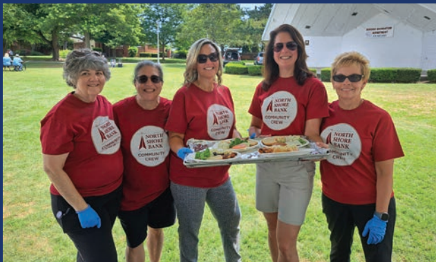
NSB volunteers served lunch at the annual Senior Day in the Park, sponsored by the Beverly Council on Aging