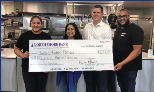
Employee Jeans Day Contributions benefited families served by the Lazarus House Ministries in Lawrence